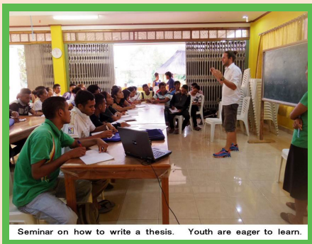
Seminar on how to write a thesis. Youth are eager to learn.

In such situation, we the Handmaids, try our best to build a just society. The key work for this objective is in the area of education. In all the Primary Schools in the city of Dili, all the children from grade 1 to 4 can go to school only for two hours a day . This is due to the fact that there are too few schools for a drastically increasing number of children. So we opened an extracurricular school from Monday to Thursday to teach several subjects . We also need to provide the children with nourishing snacks . For the older students, especially those in university, we hold weekly language classes . Every now and then we give them religious and human formation so that they can be good citizens to build their country . All these classes are free because of the economically difficult situation of the children and young people.”