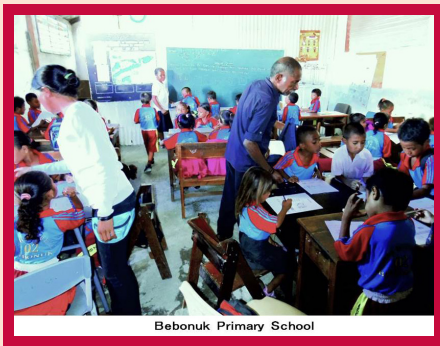
Bebonuk Primary School

It is already 16 years since this tiny country became independent, but nation building is not an easy task for all the people of East Timor . The most evident social problem is the discrepancy between the rich and the poor . A couple of years ago a four-story mall was built in the capital. It is the first and the only luxurious supermarket in East Timor . It is always filled with young people who simply enjoy window shopping in an air- conditioned building! However, the life of the ordinary Timorese, especially in the country side, is ever the same . The people are obliged to live hand to mouth, without any income to improve their quality of life.